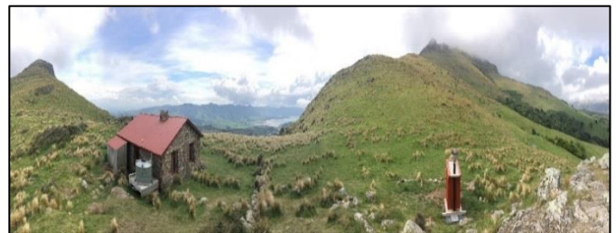
Figure 2: Packhorse Hut overlooking Lyttelton Harbour/Whakaraupō