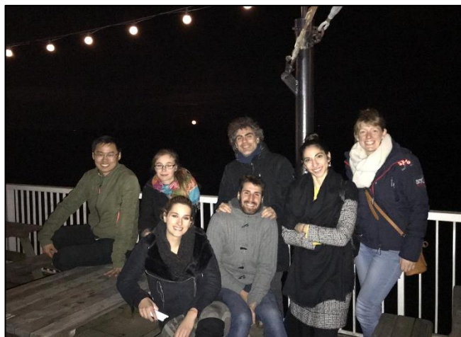
Figure 4: Severn Bore trip to Minsterworth

Our first field trip of the year took seven of our members to Minsterworth on the Severn Estuary to witness the tidal bore at the Spring Equinox. This evening out was a lot of fun and enabled students studying the effects of tide to experience first-hand the extreme range of the River Severn by the light of a super-moon.