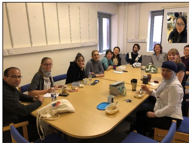
Figure 5: 1 st YPN Round Table

Our first meeting gathered a dozen members from the YPN and HRC to share lunch and ideas. During this time several topics were addressed, including the update of IAHR memberships, details of the upcoming Hydro3D workshop organised by Pablo Ouro, as well as common discussion on attending conferences and the discovery of several useful online tools.