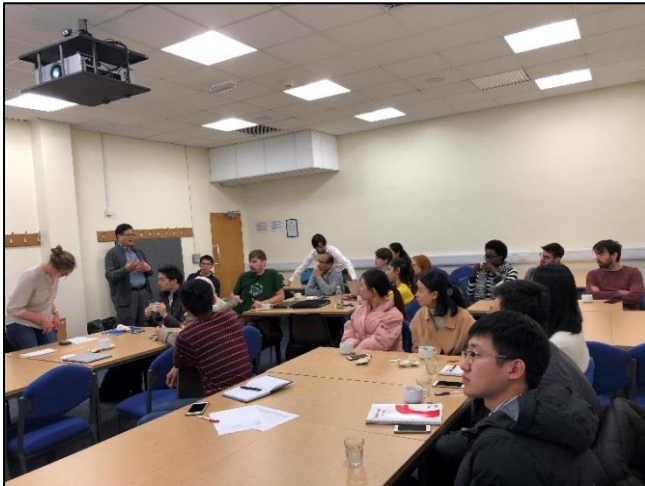
Figure 1: YPN Autumn Meeting.

Our annual YPN autumn meeting took place in November. The event was a great success with around 30 attendees from YPN and HRC. It was great to see such a range of topics as well as how they crossed over and interlinked. All presenters did a fantastic job at presenting clear and informative work, which made for a dynamic and interesting meeting.