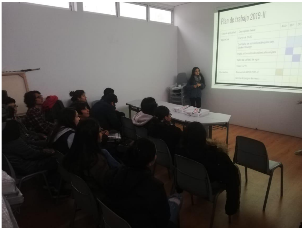
Picture 4. UTEC-YPN members meeting