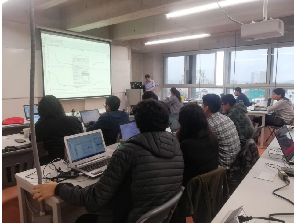
Picture 3. HEC-RAS workshop